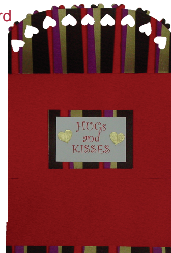
Fully Opened Card