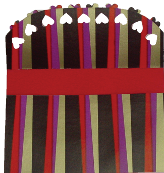
Top Flap Opened